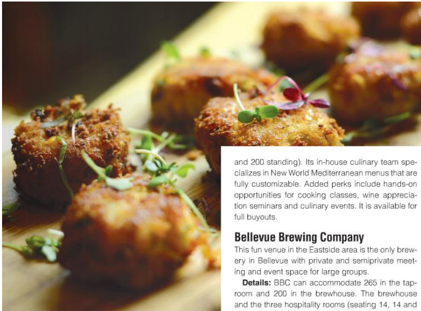
Clockwise: Westward, Seattle; crab cakes at Cast Iron Studios, Bellevue; Mobile Mavens, Seattle

and 200 standing). Its in-house culinary team specializes in New World Mediterranean menus that are fully customizable. Added perks include hands-on opportunities for cooking classes, wine appreciation seminars and culinary events. It is available for full buyouts.