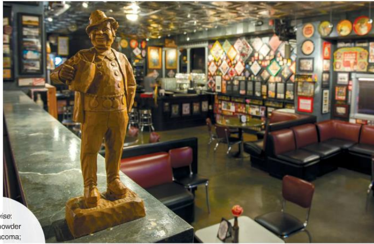
Clockwise: Duke's Chowder House, Tacoma; The Pike Brewing Company, Seattle; Charles Smith Wines Jet City, Seattle